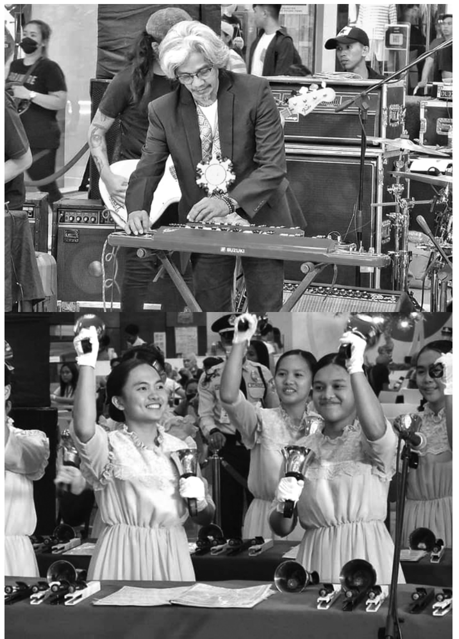
The Amazing Philippines Performing Arts in MY CITY, MY SM, MY MUSIC Exhibit at SM City Dasmariñas.

Among the ailments said to be cured by marijuana medicines include depression, epilepsy, Alzheimer's disease, sleep disorder, anxiety and others.