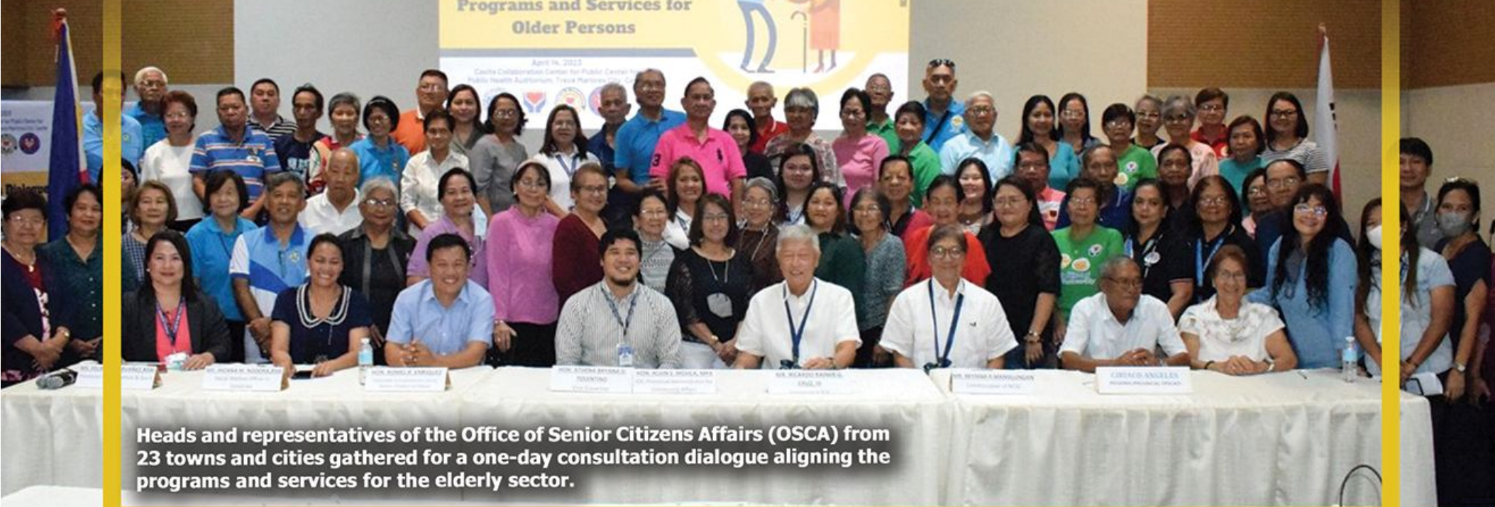
Heads and representatives of the Office of Senior Citizens Affairs (OSCA) from 23 towns and cities gathered for a one-day consultation dialogue aligning the programs and services for the elderly sector.