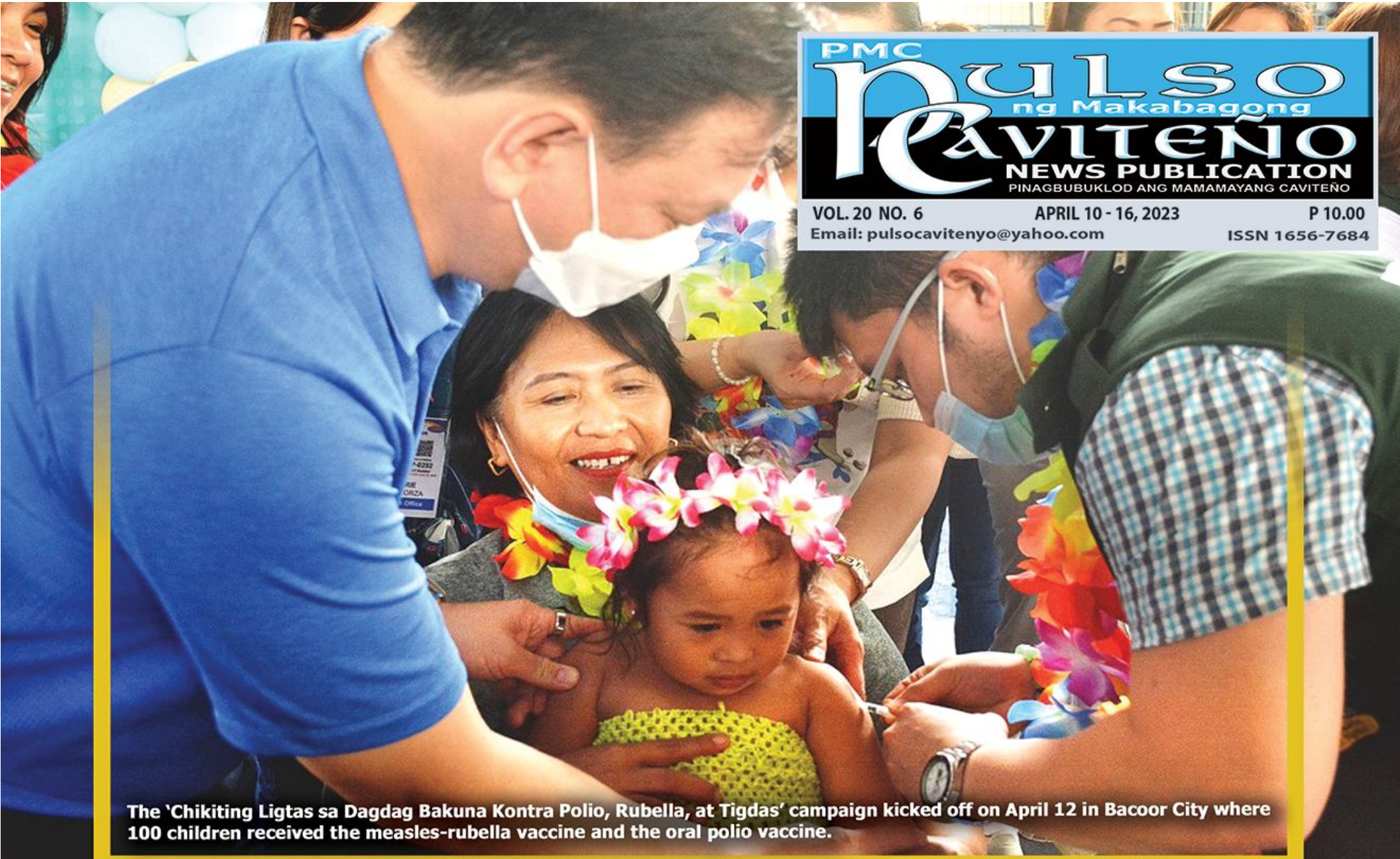
The 'Chikiting Ligtas sa Dagdag Bakuna Kontra Polio, Rubella, at Tigdas' campaign kicked off on April 12 in Bacoor City where 100 children received the measles-rubella vaccine and the oral polio vaccine.