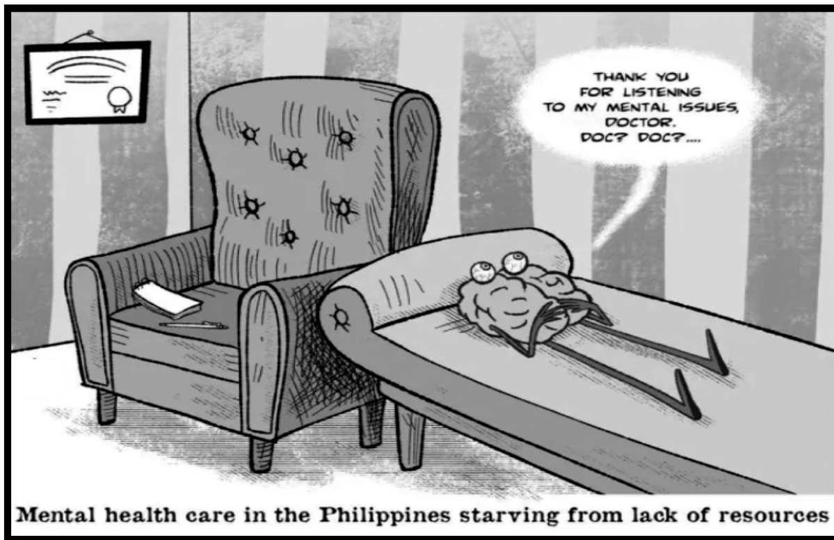
Mental health care in the Philippines starving from lack of resources

According to the Department of Social Welfare