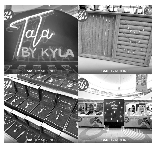
CELEBRATE WOMEN WITH SM CITY MOLINO'S WOMENPRENEUR FAIR: SM CITY MOLINO, CAVITE - It's time for empowered women to shine! SM City Molino is giving you a lot of reasons to drop by, enjoy, and celebrate women! Catch their Womenpreneur Fair at the Event Center and enjoy exclusive promos and deals from Tala by Kyla. Check out these amazing deals and #FeelAweSM only at SM City Molino.

REPUBLIC OF THE PHILIPPINES REGIONAL TRIAL COURT FOURTH JUDICIAL REGION BRANCH113 BACOOR CITY Hotline: 0927 895 8973 E-mail address: rtc1bcr113@judiciary.gov.ph