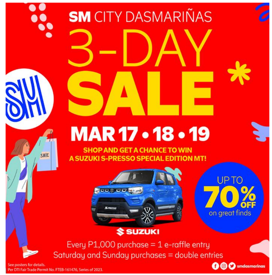
Hurry! It's again 3 Day Sale at SM City Dasmariñas! Shop, enjoy and win on March 17, 18 and 19! Up to 70% discounts on great finds! See you there!

Aside from this, SM City Bacoor also conducted the recently concluded National Simultaneoud Earthquake Drill where 253 participants including the tenants, employees, agency personnel and security forces joined to ensure that shoppers will be safe in the mall in case an earthquake happen. True to its promise to welcome shoppers with care, SM Supermalls also conduct regular trainings and seminars to strengthen their Business Continuity Management System which aims to keep their employees equipped in case of any emergency.