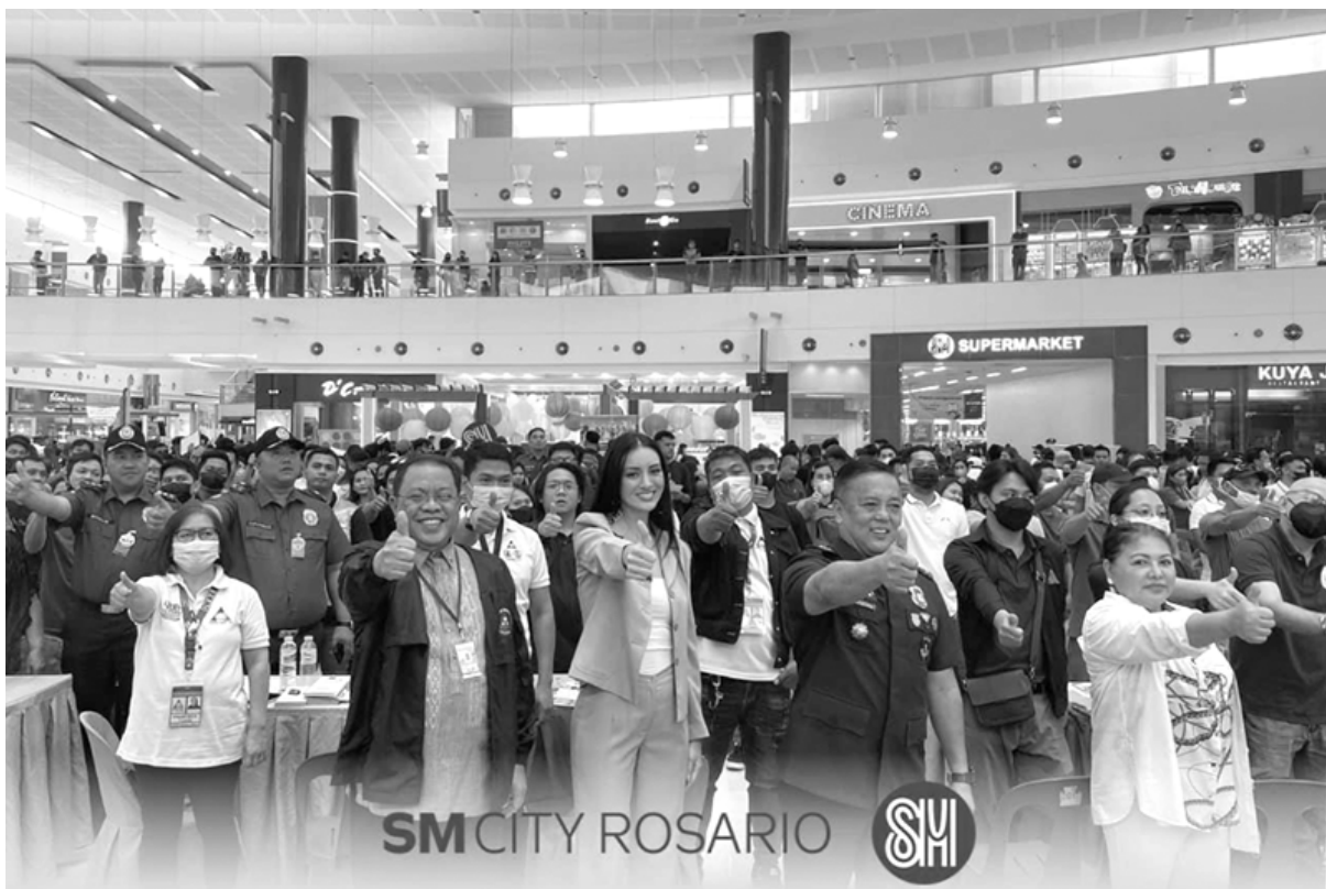
1 libong trabaho abroad para sa Caviteño at SM City Rosario - Together with the Provincial Government of Cavite, the Department of Migrant Workers, the Philippine Army, the Philippine National Police, PESO of Cavite LGU, United Filipino Global and SM City Rosario, successfully held a job fair! With more than 20 companies offering careers to 3,000 applicants, these diverse job opportunities abroad will surely open doors to many Filipinos.

Publication: PMC Pulso ng Makabagong Caviteño News Publication Dates: March 20, 27 & April 3, 2023