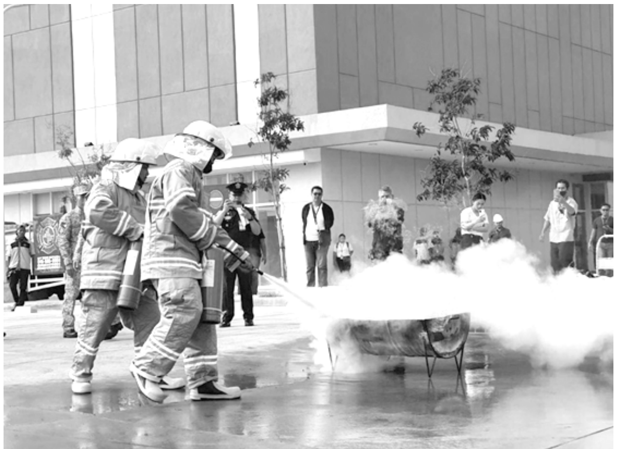
Employees of SM City Tanza participate in simultaneous fire drill by the Bureau of Fire protection Tanza Cavite in line with the celebration of Fire Prevention Month.

Publication: PMC Pulso ng Makabagong Caviteño News Publication Dates: March 20, 27 & April 3, 2023