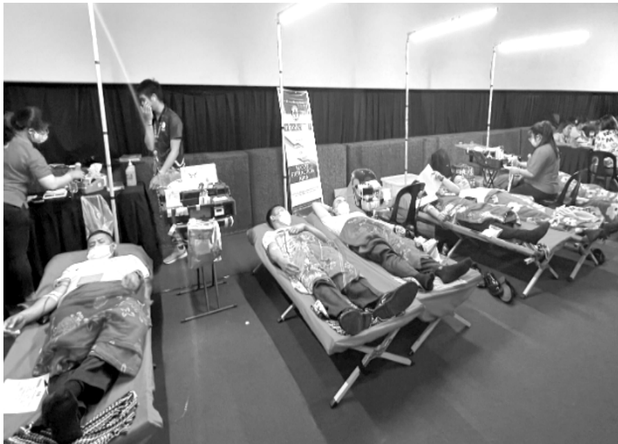
SM Marketmall and SM City Dasmariñas hold blood donation drive - Philippine Red Cross, SM Foundation, SM Marketmall and SM City Dasmariñas recently held a blood donation drive. Shoppers, Tenant and SM employees participated in the event.

Note to editors: DOST-CALABARZON is one of the regional offices of the Department of Science and Technology and is located at Jamboree Road, Brgy. Timugan, Los Baños, Laguna. For more information, you may visit us on Facebook at facebook.com/dostcalabarzon or website www.region4a.dost.gov.ph . You may also reach us at parcu@ro4a.dost.gov.ph . (By John Maico Hernandez)