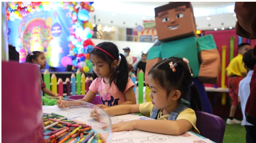
THE IMAGINATION STATION is for children who love art.