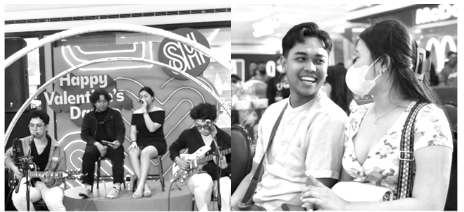
The Sweetest Valentine's is here at SM City Trece Martires! Shoppers were serenaded with love songs this Valentine's Day by the band, The Slem!

For inquiries about this press release please email us at: corpcomm@mptsouth.com