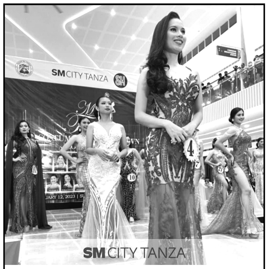
Mutya ng Tanza Candidates stun Tanzeño at SM City Tanza - Candidates from Mutya ng Tanza walked the runway with glam and elegance at SM City Tanza during its pre-pageant, showcasing the works of local designers. Mutya ng Tanza is annually held in connection with the celebration of Tanza Day. Since SM City Tanza is now open, it is the perfect venue for such an event. Catch them on the coronation night on February 24 at the mall event center of SM City Tanza.

Note to editors: DOST-CALABARZON is one of the regional offices of the Department of Science and Technology and is located at Jamboree Road, Brgy. Timugan, Los Baños, Laguna. For more information, you may visit us on Facebook at facebook.com/dostcalabarzon or website www.region4a.dost.gov.ph. You may also reach us at parcu@ro4a.dost.gov.ph.