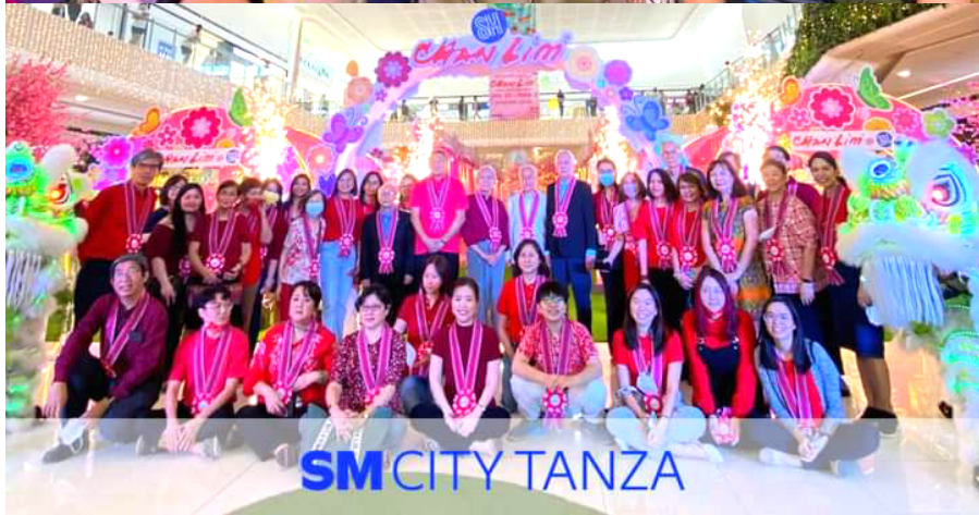
44th CHAN LIM Family of Artist and Students Exhibit at SM Tanza.