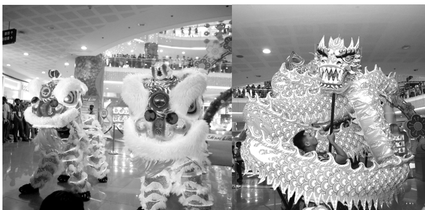
During the Chan Lim Launch, Dragon and Lion dance sparks Chinese New Year celebration at SM City Dasmariñas.

The Chan Lim Family and SM Supermalls go way back to 1995, when the first Chan Lim Family Art Exhibit was held at SM Megamall.