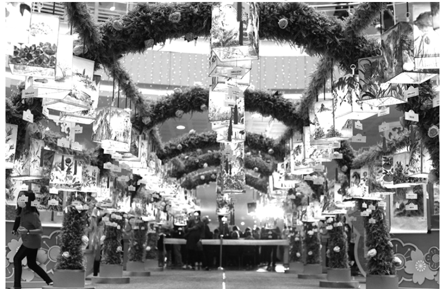
The lantern art tunnel is an attraction to the Chan Lim Exhibit with 150 hanging art lanterns.