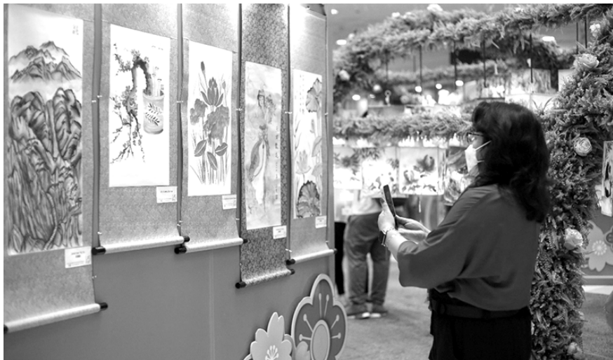
Artworks on scrolls are also displayed at the Chan Lim exhibit in SM City Dasmariñas.

Chinese New Year came early at SM City Dasmariñas through the opening of the 43rd Chan Lim exhibit which features 350 artworks by 60 artists.