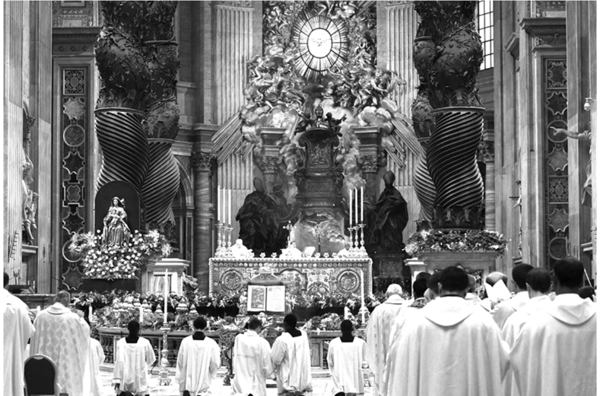
Cardinal Luis Antonio Tagle served as the main celebrant of the Liturgy of the Eucharist for the Epiphany Mass with Pope Francis offering the homily.

Cardinal Luis Antonio Tagle served as the main celebrant of the Liturgy