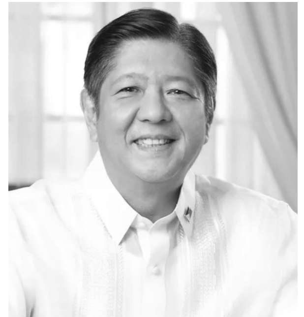
President Bongbong Marcos

To optimize the government's Information and Communications Technology (ICT) resources, the government will continue to develop and implement interoperable systems that will further implement seamless sharing of data sources, such as the Philippine Identification System and electronic Business Permits and Li-