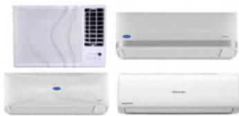
40 lucky winners will win Carrier Airconditioners at SM Appliance Center's Summer FUNalo Raffle Promo.