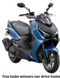
Five lucky winners can drive home the KYMCO KRV 180i TCS Motorcycle in the Summer FUNalo Raffle Promo. Shop at any SM Appliance branch or online channel - www.smappliance.com or https://shopsm.com/collections/smappliance-to-earn-affle-entries .