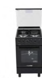
Cook your family's favorite recipes with this La Germania Range from Italy. Features include 3 gas burners, 1 electric hotplate, gas oven and grill.