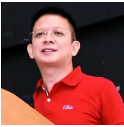
DON'T FIGHT • 5 Sorsogon Gov. Francis "Chiz" Escudero