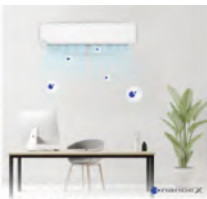
Keep cool this summer with this Panasonic 1.5HP Premium Split Type Inverter Airconditioner. It's energy efficient too.