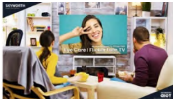
Have a cinematic experience in your home this summer with this innovative Skyworth 4K LED Smart TV exclusively from SM Appliance Center.

SM Appliance Center has all the cool and innovative appliances that will make staying indoors fun, comfortable and convenient this summer. More than that, you can win exciting prizes in the Summer FUNalo Raffle Promo.