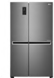
This exclusive LG 24 Cu Ft Side By Side Inverter Refrigerator has SmartThinQ technology, which you can control and diagnose your refrigerator by your smart phone anywhere, anytime.