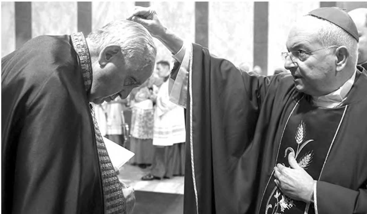
A cardinal sprinkles ashes on Pope Francis's head during the Ash Wednesday Mass at the Santa Sabina Basilica in Rome, Italy on Feb. 22, 2023.