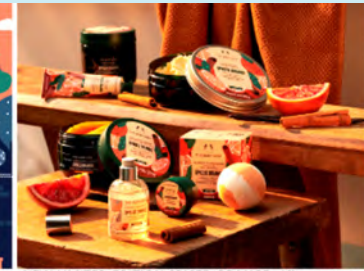
cozy hug, the new limited edition Spiced Orange body care collection brings pure comfort. These skin-loving treats are infused with orange rind essential oil, known for its relaxing scent. And it's all topped off with the scent of baked spices and vanilla to immerse