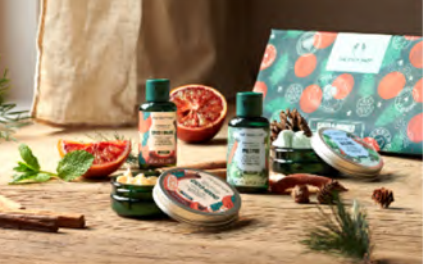
Wonder Orange & Pine Mini Collections, it's the perfect way to