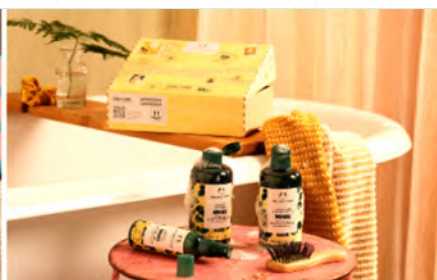
serious pampering, the Sparkle and Shine Hair care gift packs a oo, conditioner, hair mist and mini brush, this gift set is perfect for anyone who wants more radiant hair this Christma

This Christmas, The Body Shop is wishing for a fairer future for all. That's why every one of its gifts is enriched with ingredients and/or packaging from its Community Fair Trade partners. Community Fair Trade is The Body Shop's bespoke program that helps its small-hold producers gain market GIFTS • 5