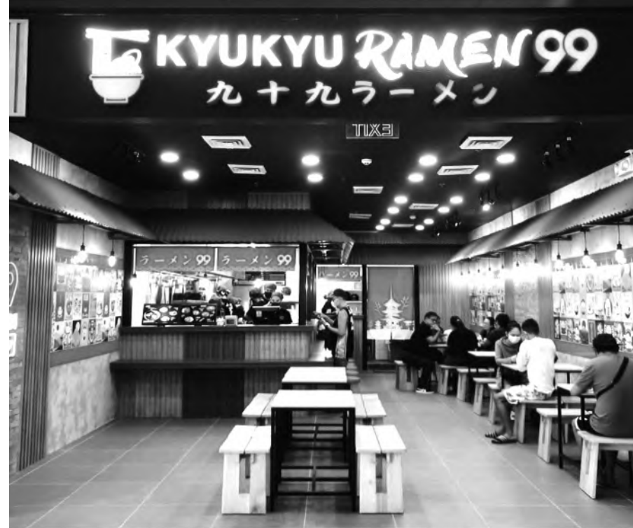
SM CITY TRECE MARTIRES

Integrated School in Nagtipunan, Quirino Province; Villa Espina Elementary School in Lopez, Quezon; and Landang Laum Elemen-School Zamboanga City.