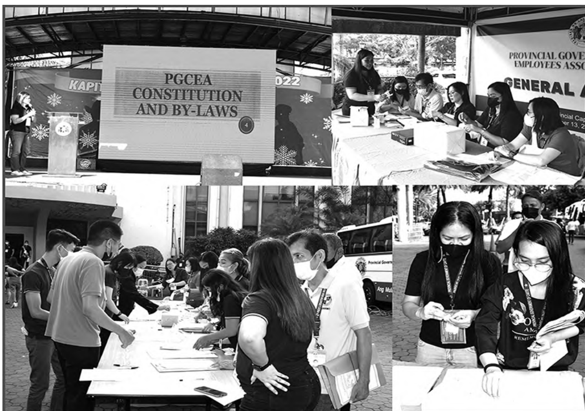
PGCEA holds general assembly. On December 13, 2022, Provincial Government of Cavite Employees' Association successfully held its first general assembly at the Provincial Capitol Grounds, Trece Martires City spearheaded by its interim officers. During the assembly, PGCEA updates were reported to the body. Likewise, the association's Constitution and By-laws was ratified. Upcoming activities were announced including the filing of candidacy and election of new officers.