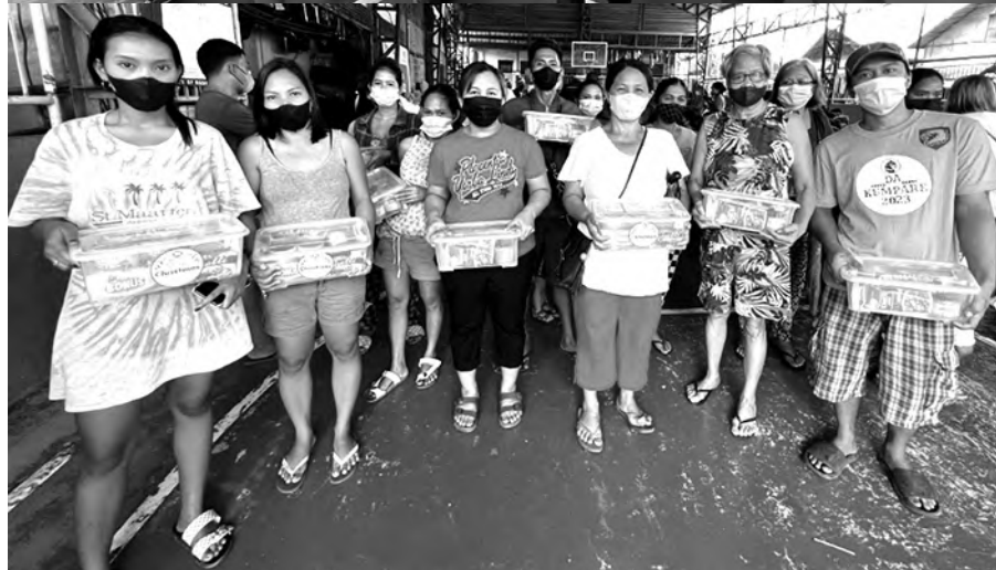
Dasmariñas Residents receive Christmas cheers - SM Cares, together with SM Marketmall and SM City Dasmariñas, shared Christmas Cheers to 300 families of Barangay Buro 1 in Dasmariñas City Cavite.