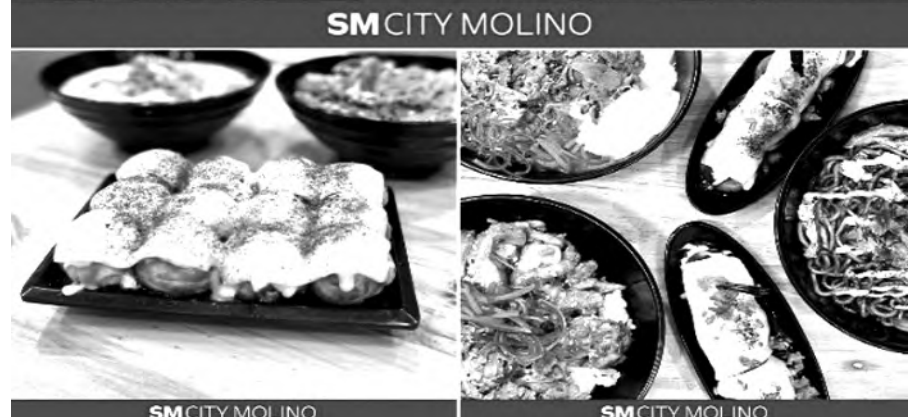
TAKOYADON PLUS, NOW OPEN AT SM CITY MOLINO! SM CITY MOLINO, CAVITE – Craving for Japanese food? No more spending too much just to say oishi only at Takoyadon Plus! Visit and enjoy your Japanese favorites without breaking the budget! Try the best and authentic Takoyaki, Yakisoba, Udon and Donburi available for solo, sharing and feast servings! Visit Takoyadon at the 2nd Level of SM City Molino today!