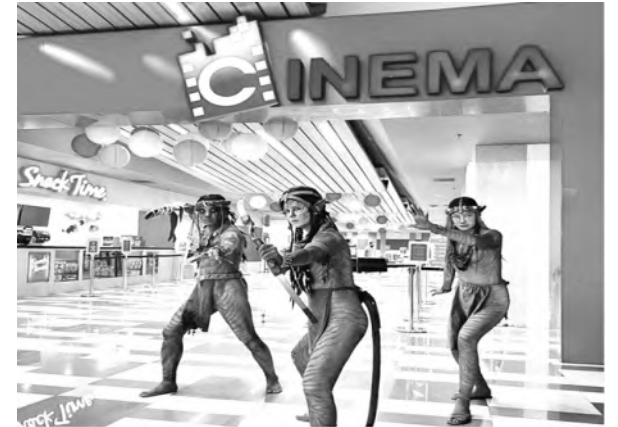
RETURN HOME TO PANDORA AT SM CITY TRECE MARTIRES CINEMA - Experience Avatar: The Way of Water unlike anything you've seen before! Now showing in all SM Cinemas nationwide. Get your tickets now!

The President also thanked the Department of Budget and Management (DBM) for its efforts in passing the government spending program for next year.