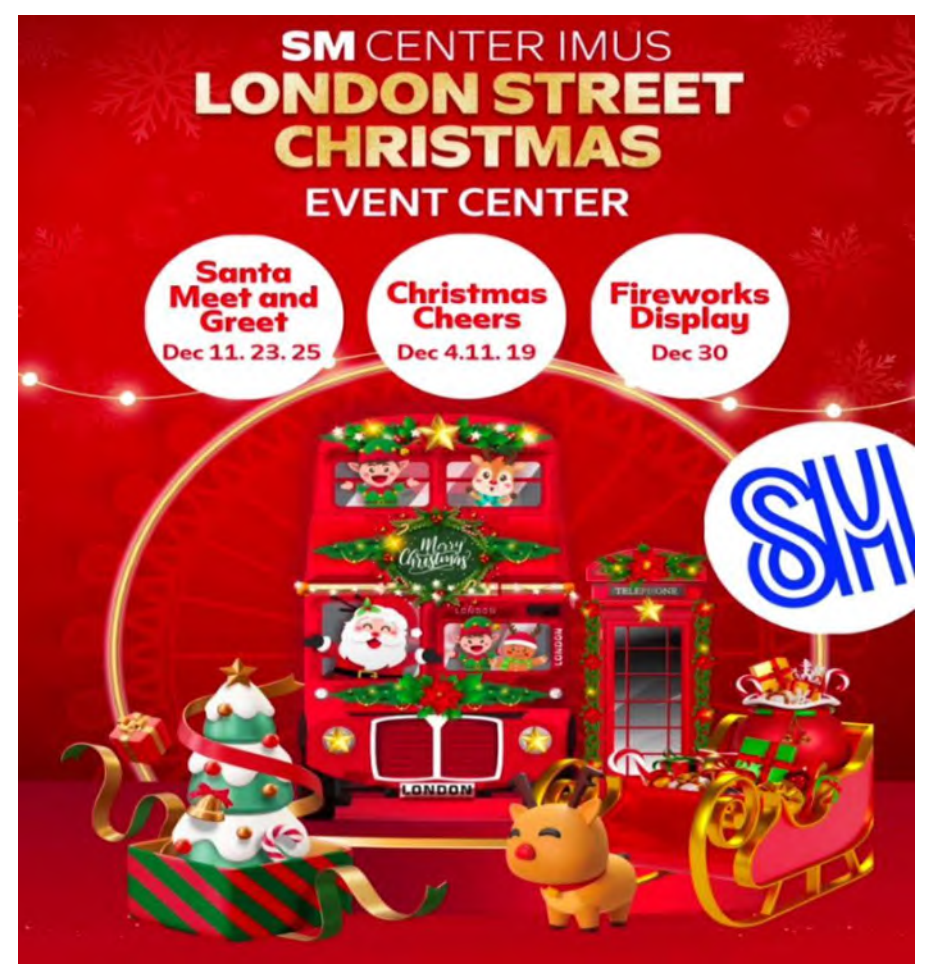
EXPERIENCE A LONDON STREET CHRISTMAS AT SM CENTER IMUS, CAVITE - Experience #HappyChristmasAtSM as we brings you a great London Street Christmas vibe! Meet Santa with a Meet and Greet on December 11,23, and on Christmas Day! Join us on a our Christmas Cheers on December 4,11, and 19. Witness our Fireworks Display as you chill at SM Center Imus on December 30. See you at SM Center Imus for more exciting treat this Holiday Season!

Among the directors' objectives are "to give recognition to the PSTD's suc-DOST LAUDS • 7