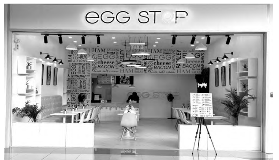
Egg is everyone's favorite, right? You can't go wrong in eating eggs, even the simple home-cooked sunny-side-up or scrambled egg! How about eggs in sandwich with bacon, tuna salad, ham, sea salt cream? Surely, you will LOVE eggs more than it is usually it... Experience the #1 Korean Egg Drop sandwich in SM City Dasmariñas today! Located at the 2nd level near cinema.