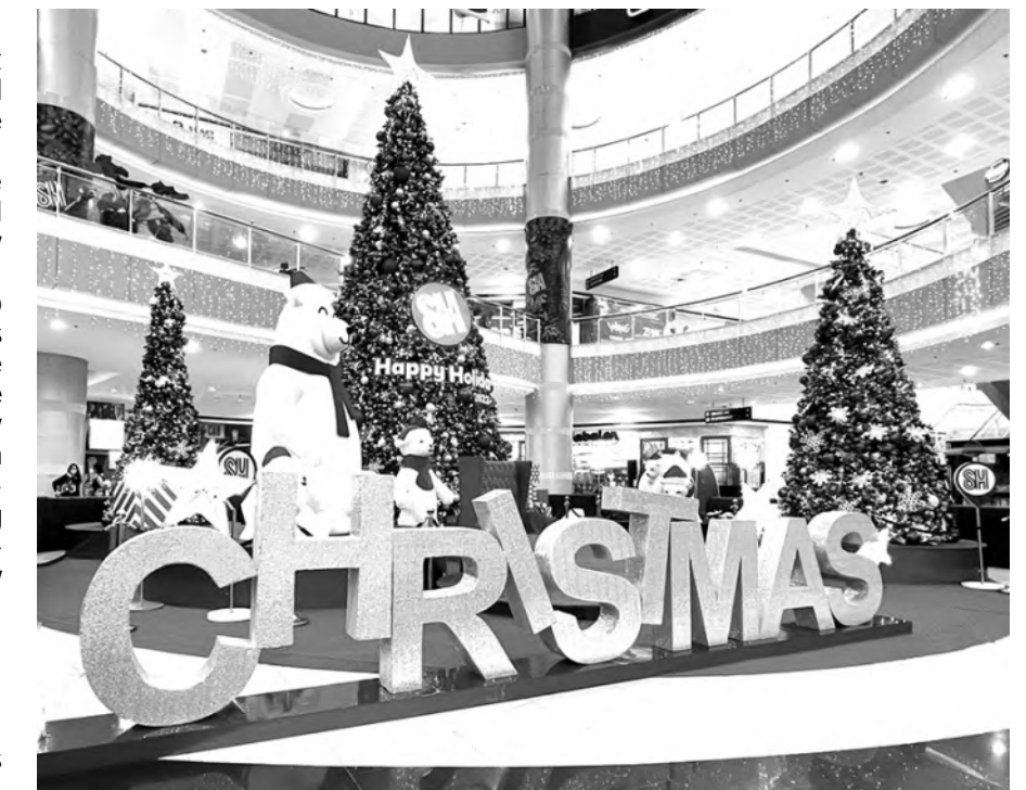
The lighting of the mall's giant 30 foot Christmas Tree covered with icy white snowflakes and sparkly lights, surrounded by playful polar bears signal the start of SM's nationwide Happy Christmas campaign. Starting November 5, 2022 to January 8 2023, SM shoppers can take snapshots and capture #AweSM fam memories around the wonderfully Whimsical Polar Christmas attraction at the Annex Event Center. For those who want a cool holiday adventure, glide into the fun at SM Storyland's Mobile Ice Skating Rink located at the Main Event Center.

SM Supermalls has also created outdoor attractions for that pictureperfect, memorable shopping, dining, and leisure activities for the whole family. At The Podium, shoppers are in for Joie De Vivre with its Holiday Night Cap on October 21-23 and 28-30 at the ADB Al Fresco, and the Food Lab on October 24-30 at the Atrium East