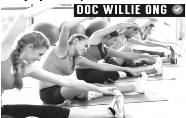
TAMANG EHERSISYO PARA SA LAHAT PAYO NI DOC WILLIE ONG

Tandaan: uminom ng sapat na tubig bago at habang nag-e-ehersisiyo. Good luck.