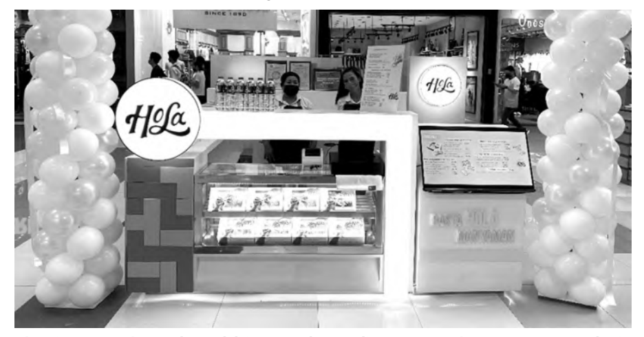
The famous cheesebread bites and trending creamcheese ensaymada is now at SM City Dasmariñas! HOLA is an original brand from Pampanga. Visit its kiosk store at the lower ground from of SM City Dasmariñas

www.smsupermalls.com and follow @smsupermalls on all social media accounts to stay updated on the various holiday happenings.