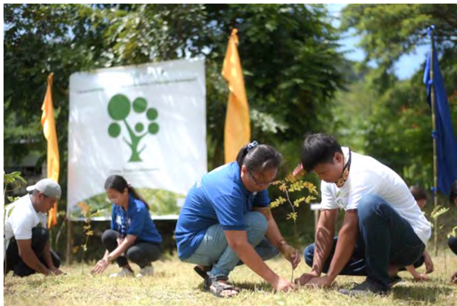
Volunteers from SM Foundation and community members undertake the planting of flowering trees in Nasugbu.

SM Foundation, Inc. the social good arm of the SM group, and the Fast Retailing Foundation (FR Foundation), a general incorporated foundation in Japan, formally launched the 'Grow Trees Community' project in Nasugbu, Batangas last September 27 as the first step of three provinces for their 'treescaping' and reforestation initiative.