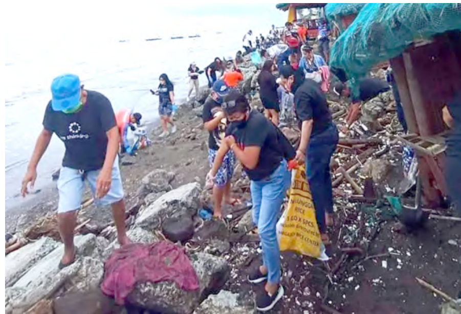
Caviteño volunteers clean up the shore of Barangay San Rafael 3 in Noveleta, Cavite as part of the International Coastal Cleanup on Saturday, Sept. 17, 2022.