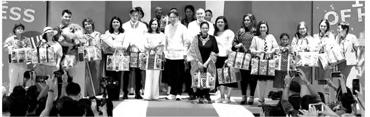
In photo: men and women of substance from the Quezon City LGU, SM Supermalls, Girl Scouts of the Philippines, Brownies Unlimited, Spark PH, and Down Syndrome Association of the Philippines

Through the campaign, SM Supermalls encourages Filipinos to support the advocacies of individuals and organizations that provide opportunities and create livelihood for their communities. For this year, SM