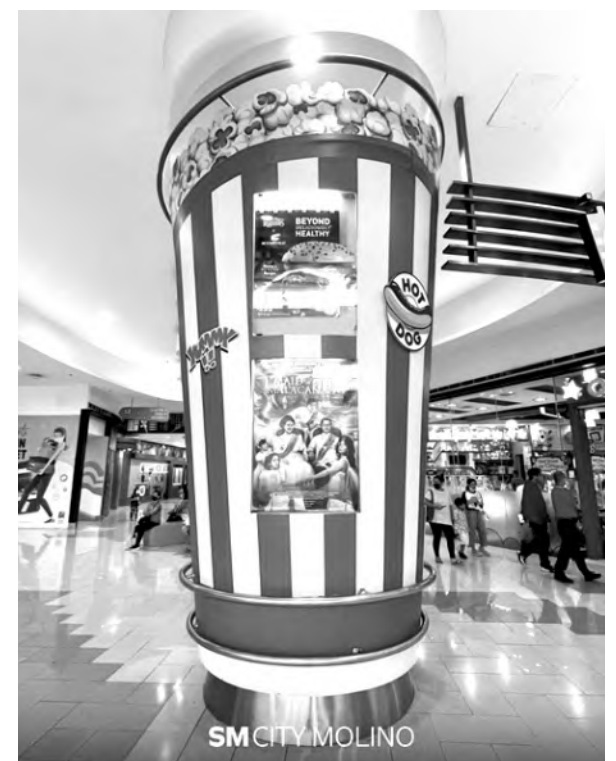
Strike a pose with this Giant Popcorn Bucket at SM City Molino located at the second level near Cinema Lobby. This IG worthy backdrop will surely be a hit for you and your family.

For groups and organizations interested to volunteer for the activity, you may coordinate with the nearest DENR Office in your area.