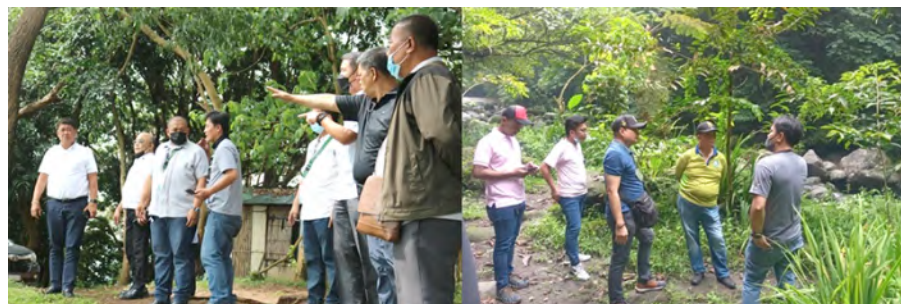
Ocular visits of DENR Officials at Brgy. Pintong Bukawe, San Mateo, Rizal (left photo) and Brgy. Taytay, Majayjay, Laguna (right photo) last September 5 and 7, 2022, respectively.

The tree planting will serve as the Kick-Off Ceremony for DILG's Tree Planting Project with the theme: "Buhayin ang Pangangalaga ng Kalikasan" where DENR • 5