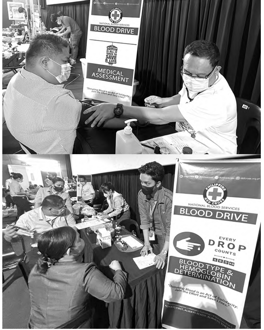
The Philippine Red Cross Cavite chapter recently held its second round for 2022 of blood donation drive at SM City Dasmariñas. Customers, tenants and employees participated in this campaign. This was once again a very significant event at the mall amidst an increasing number of dengue cases in Cavite. Donating blood will surely save lives.

The Tanza Municipal Police Station will release an official report on the accident.