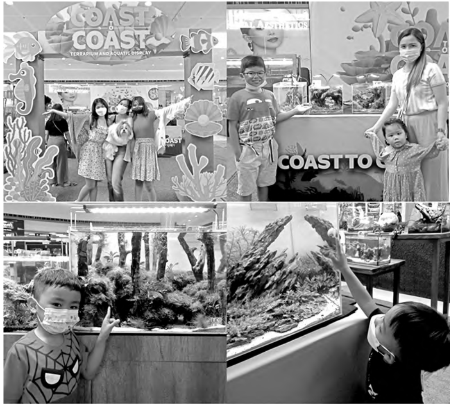
DISCOVER TERRARIUM AT SM CENTER IMUS, CAVITE – Looking for your terrarium design inspiration? You can now enjoy from over 50 terrarium and aquatic exhibit at sM Center Imus! Witness Coast to Coast Terrarium and Aquatic Display in partnership with Atlantis Aquatic Hub, and discover diverse Aquascape ideas from September 3 until September 17,2022 because #YoureAlwaysWelcomeHere to discover your hobbies.

A PAWSOME DAY AT SM CITY MOLINO, CAVITE – You're always welcome here to have a pawsome day with your family and pets! It's always a fun time with fur parents and their fur babies at SM City Molino! Pets enjoyed their treats and freebies plus they got a chance to get free microchips! A bunch of lovely pawfriends are also looking for new fur parents from Tails of Freedom Animal Haven and Sweet Pets Haven. See you in the next fur date at SM City Molino!