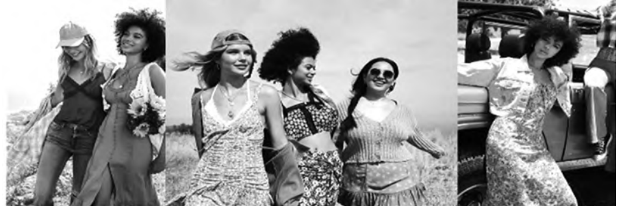
Romantic, bohemian, and forever feminine. Forever 21's satin lace trim-cami, distressed flare jeans, plaid button-up shacket, cami midi dress and crochet vest.

With face-to-face classes, back after two years of virtual learning, it's time to say hello again to teachers, classmates, and friends in the classroom and on-campus.