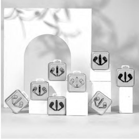
Colorful Wire Control In Ear Earphones with mic model. All available at Miniso.

Get a blast of cuteness overload as Japanese lifestyle retailer MINISO launches its BIG SALE this August! You can get it up to 70% off from select items from August 3 to 7 at SM City North Edsa Skydome.