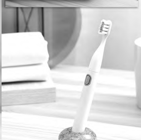
Electric Toothbrush with soft bristles and replaceable brush head to level up regular brushing.