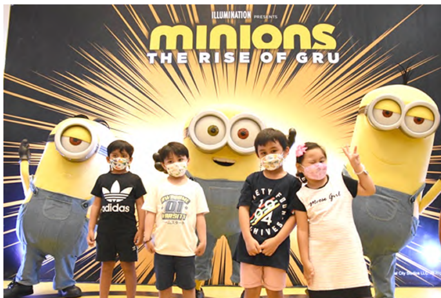
Kids grabbed the chance to take photos with the Minions

SM City Rosario set up the Minions Fun playhouse recently at its event center, making it a huge attraction for the shoppers. Kids and kids at heart enjoyed a cheerful and fun-filled afternoon with Bob, Kevin and Stuart as they played, sang and danced at the playhouse.