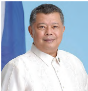
DOJ Secretary Jesus Crispin "Boying" Remulla

The House of Representatives has adopted House Resolution 100, calling on the Commission on Elections to hold Special Elections for the 7th District of Cavite.