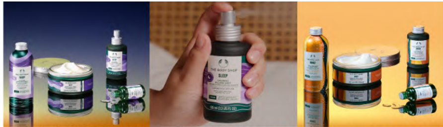
THE SLEEP WELLNESS RANGE. Get sleep back in sync with The Body Shop's new sleep routine, clinically proven by the European Sleep Center to help your rise more energised. Includes the Sleep Relaxing Hair and Body Wash, Sleep Balmy Body Cream, Sleep Calming Pillow Mist and Sleep Essential Oil.

From stress-induced insomnia, to a self-love crisis, the last couple of years have deepened wellbeing challenges for millions of people.