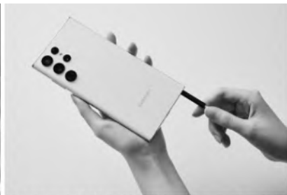
Samsung Galaxy S22 Ultra features a 6.8 inch screen, four rear cameras including a 10x optical zoom and built-in S Pen stylus. One (1) lucky major winner can get this Samsung super phone in the Gadgets Everyday Raffle Promo.