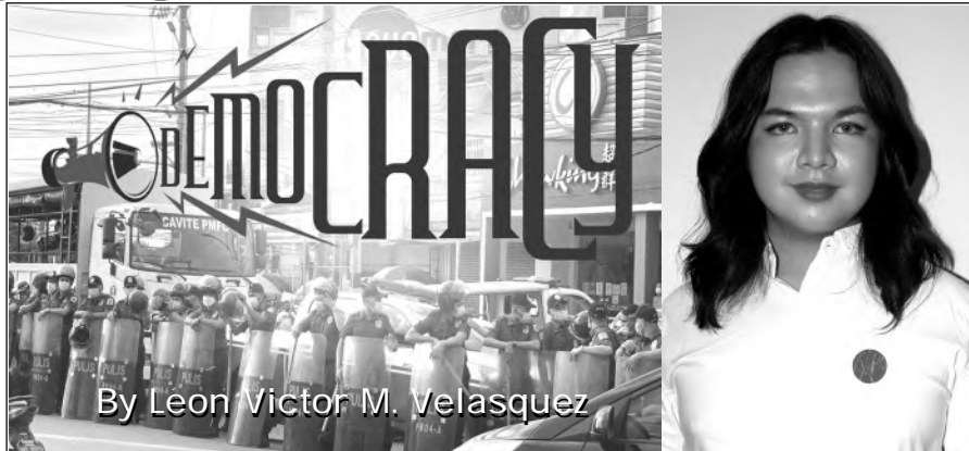
By Leon Victor M. Velasquez

For what it's worth, the SOGIE Bill is a safe space for everyone. It is inclusive in the context of false accusations in your environment when you are told that you are gay just because you act feminine or because you act masculine, you were presumed belonging in non-binary groups when in fact, you consider yourself as heterosexual; It is not re-