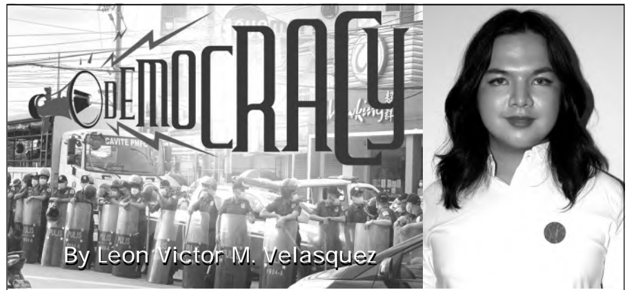
By Leon Victor M. Velasquez

The Chill At Wind festival is one of the many #GoodTimesWithTheGoodGuys The Strips at SMDC activities, follow www.facebook.com/SMDCTheStrips for upcoming events and latest updates.