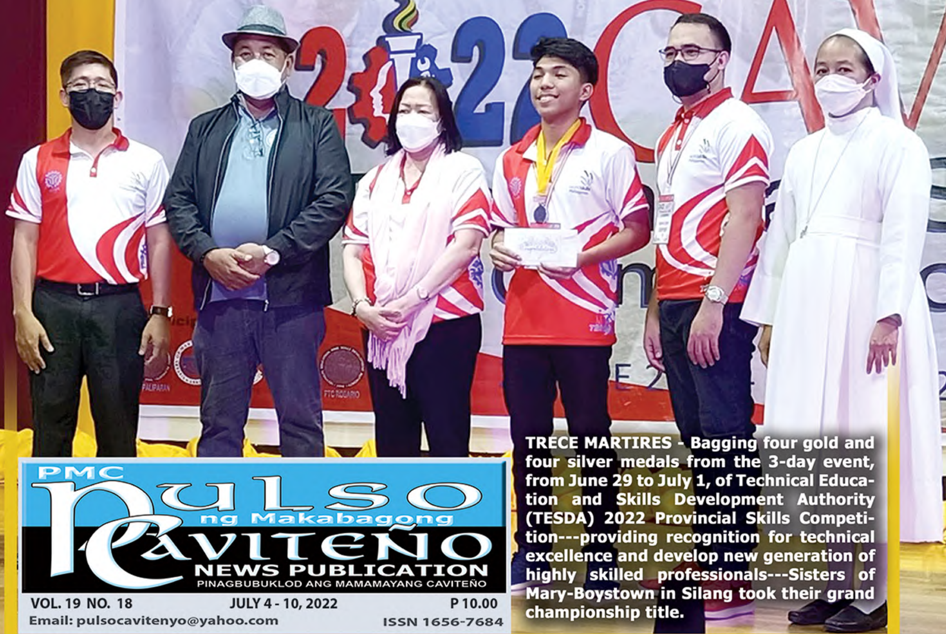
TRECE MARTIRES - Bagging four gold and four silver medals from the 3-day event, from June 29 to July 1, of Technical Education and Skills Development Authority (TESDA) 2022 Provincial Skills Competition---providing recognition for technical excellence and develop new generation of highly skilled professionals---Sisters of Mary-Boystown in Silang took their grand championship title.