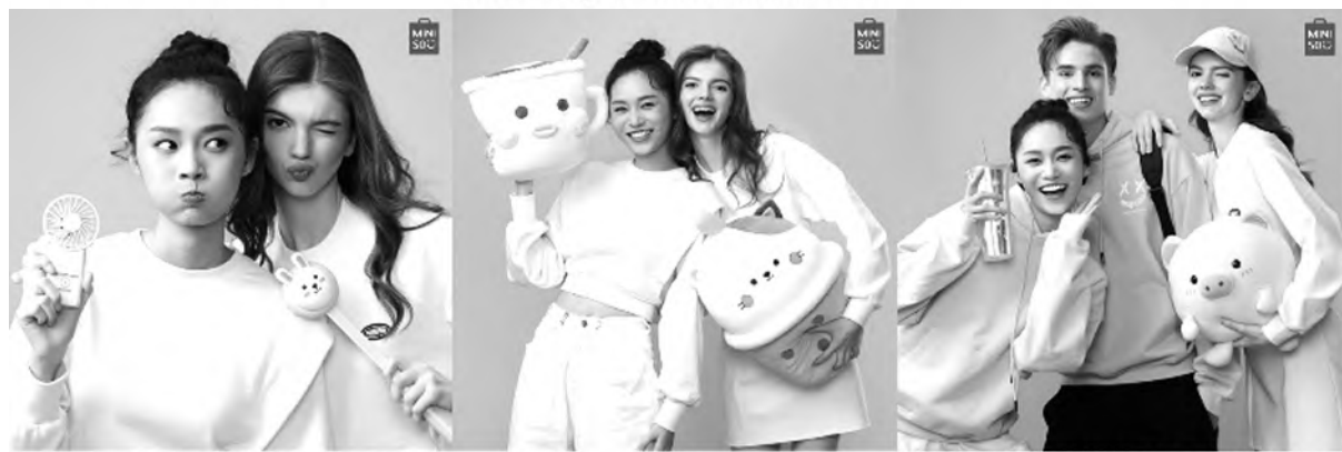
So many lovely items and giftables you can choose from when you visit Miniso.