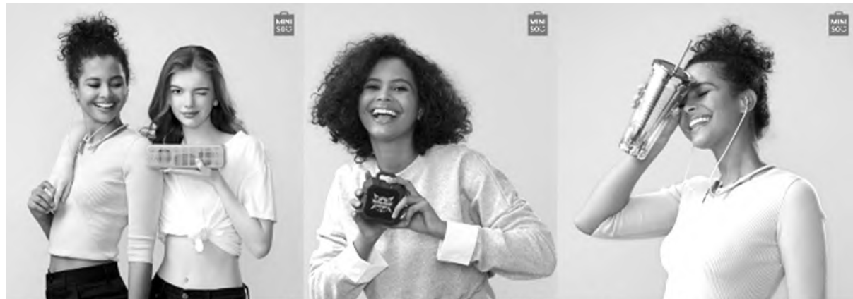
Shop and earn exciting perks and rewards with the Miniso Wink Rewards Card.

Japanese lifestyle retailer Miniso recently launched its Miniso Wink Rewards Card loyalty program with lots of exciting perks and rewards. Now, there's more reason to check out and shop for Miniso's fun and fashionable finds.