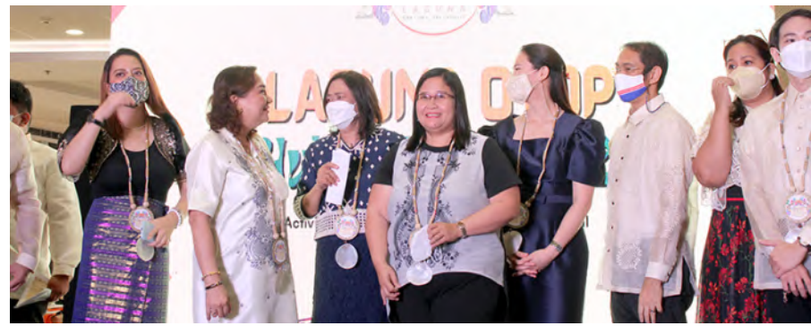
Mandaluyong City - The Department of Trade and Industry – Laguna Provincial Office (DTI Laguna), through the One Town, One Product Next Generation (OTOP Next Gen) Program and in partnership with SM Megamall, implemented the LAGUNA OTOP HYBRID EXPO 2022 at the Mega Fashion Hall of SM Megamall last June 8 to 12, 2022. A total of fifty (50) exhibitors who were assisted under OTOP Next LAGUNA OTOP • 2