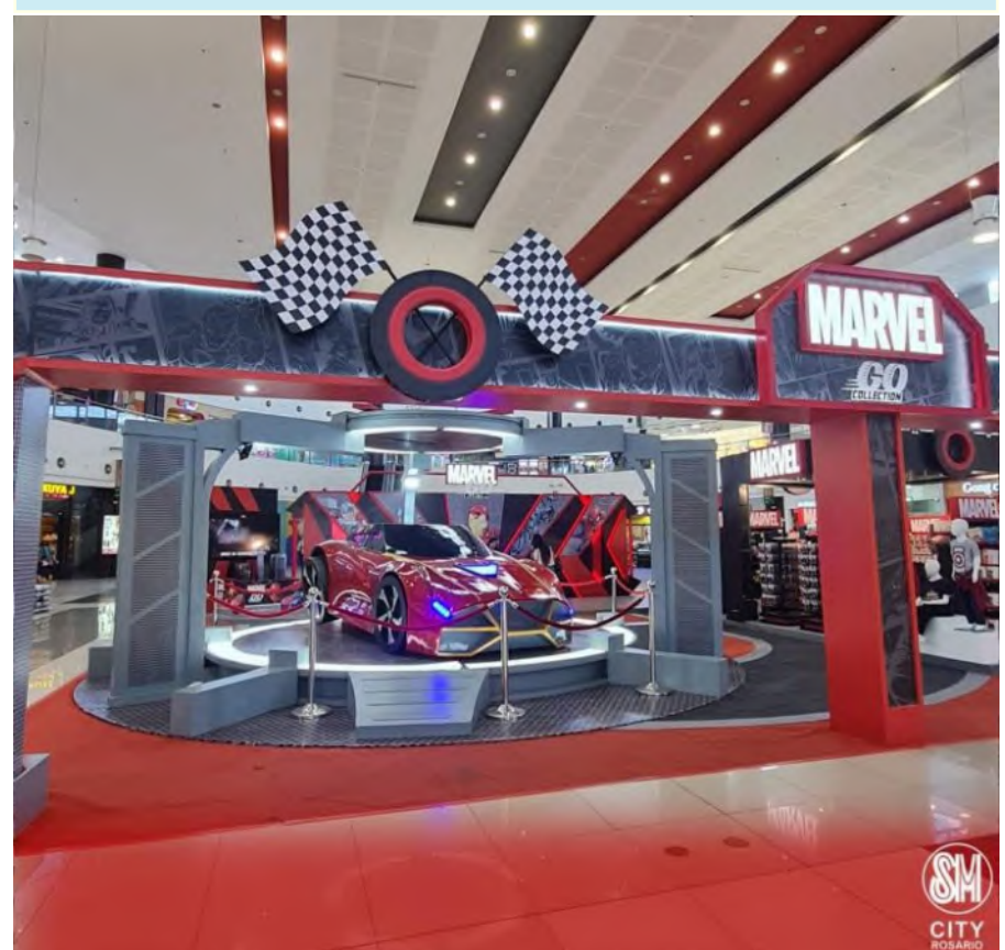
MARVEL GO COLLECTION, NOW AT SM CITY ROSARIO, CAVITE - Fueled by your imagination and designed by Stark Industries, the Marvel GO Collection puts you in the driver's seat. Take the wheel and be your own hero. Bring your playmates and collect all these Marvel GO collection here at SM City Rosario. See you Marvel fans!

The Botika on Wheels program was launched in June 2020 as a response to the basic medical needs and health care services of Caviteños during the community quarantine period when the citizens were not allowed to leave their home and residences. (PICAD)