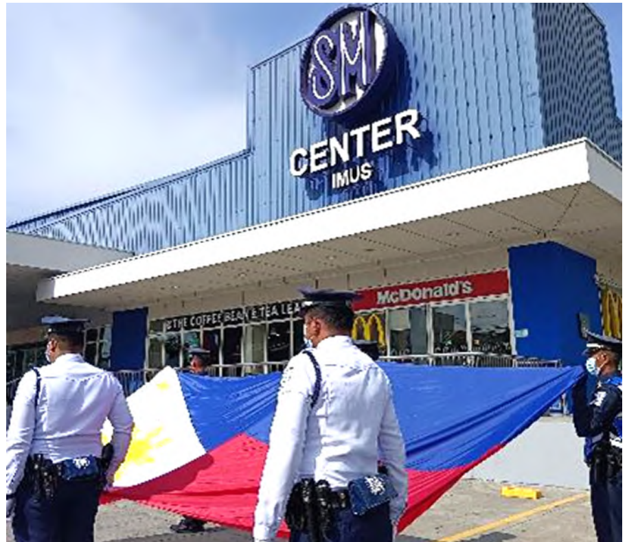
SM Center Imus Security Personnel carefully carrying the Philippine Flag during the Parade of Colors.

Also highlighting the modern day heroes such as our economic front liners, the mall managers gave encouraging messages to the Security force, house-keeping personnel, and employees for their courage to help boost the economy especially amidst the pandemic.