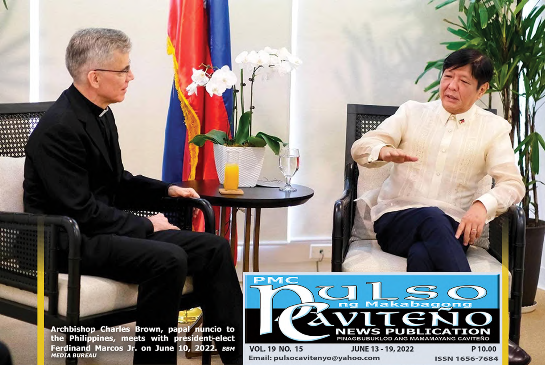
Archbishop Charles Brown, papal nuncio to the Philippines, meets with president-elect Ferdinand Marcos Jr. on June 10, 2022.