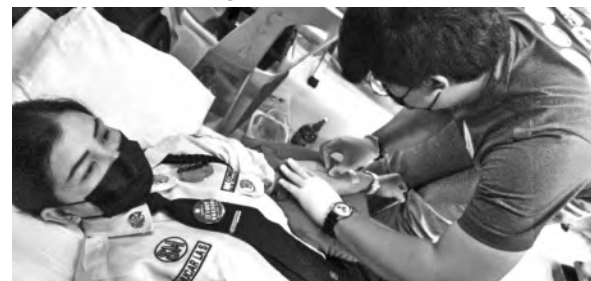
One of SM City Trece Martires' Security personnel while Trece Martires CHO personnel insert the needle to collect blood.

SM CITY TRECE MARTIRES, CAVITE – In celebration of the World Blood Donor Day, Alagang Kapatid Foundation Inc. and the Department of Health CHD CALABARZON successfully collected a total of 198 blood units among 244 total participants. In partnership with General Emilio Aguinaldo Memorial Hospital, Southeast Asian Medical Center and Philippine General Hospital, the Trece Martires City Health Office gathered blood donors from different sectors including factory workers, mall employees and tenant staff, and other nearby barangay residents at SM City Trece Martires to help save more lives through blood donation.