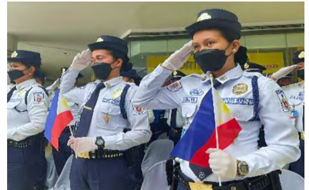
SM City Molino lady guards salute to the Philippine Flag.