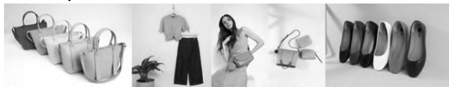
To have and to hold. Zendaya bags for everyday office work from Parisian at The SM Store.

Working girls can inject a hint of something fresh into their look – online or offline – with short suits,