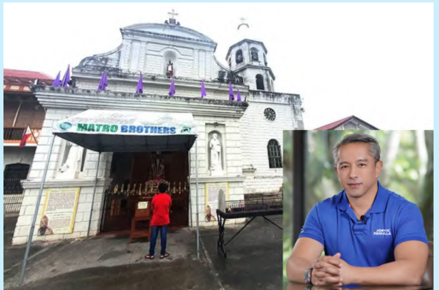
The Sta. Cruz Church in Tanza, Cavite will be the venue of the provincial government's official inauguration on June 27, 2022.