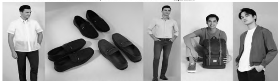
Elegant Jusi Barong as this is fashion perfect for formal gatherings and events at work.