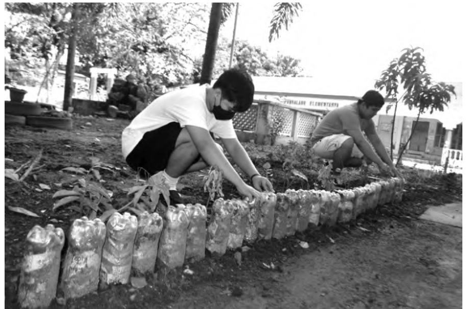
Bottle bricks can be used as fence or pathway guide in schools and homes.

der forty-five minutes while helping decongest EDSA, MIA Road., Roxas Boulevard and other major thoroughfares. Cavite Infrastructure Corporation, concessionaire of CAVITEX and CAVITEX C5 Link is a subsidiary of Metro Pacific Tollways Corporation (MPTC), the toll road development arm of Metro Pacific Investments Corporation (MPIC). Aside from CAVITEX and CAVITEX C5 Link, MPTC also holds concession rights for Cavite-Laguna Expressway (CALAX), North Luzon Expressway (NLEX), the Subic-Clark Tarlac Expressway (SCTEX), the NLEX Connector Road, and the Cebu-Cordova Link Expressway (CCLEX) in Cebu.