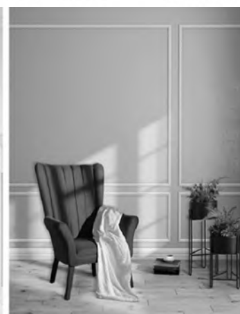
Scandinavian inspired hi-back Adriana Accent Chair.