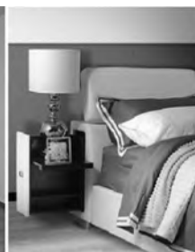
Our Home's Gifford Bedframe pullout side table is perfect for this Unice Glass Table Lamp and for your other bedside essentials.