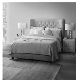
Sweet dreams ahead with Our Home's Geralt Bedframe with tufted headboard and 2 built-in drawers and Gavino Bedside Table. Only at Our Home. Great Designs. Great Prices.