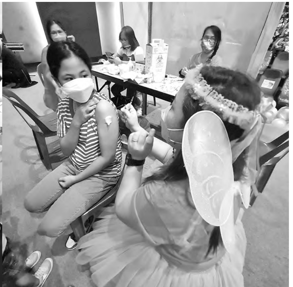
Resbakulandia at SM City Rosario: Kids enjoy the Encantadia themed resbakuna at SM City Rosario. Health workers wear fairy and animal costumes to promote a friendly vaccination site for the children. Mascots from Mall tenants were also present to entertain kids while waiting to be vaccinated. This idea helps kids to reduce fear and nervousness that the COVID-19 vaccine might bring them.