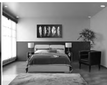
Sleep in style with Our Home's modern contemporary Gifford Bedframe with an adjustable headrest and pullout side table. The box shaped Andrei Accent Chair creates the perfect reading nook in your bedroom.