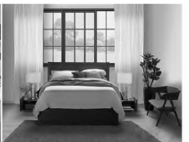
A goodnight's sleep is guaranteed in this classic wooden Gunther II Bedframe with padded headboard, 2 built-in drawers and 2 bed side pullout nightstands. The Sarah Accent Chair made from Malaysian oak with a bentwood backrest design is perfect for your nighttime reading.