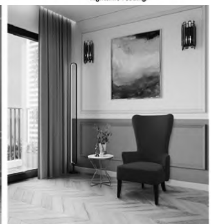
Create a special corner in your room with Our Home's Amanda Accent Chair in rich velvet fabric and Peresia side table with marble top and gold metal base.

Most of us design our bedrooms with a good night's sleep and relaxation in mind. That's why we have stocked up on soothing essentials – soft sheets, cozy comforters, pretty throw pillows, and cuddly blankets.