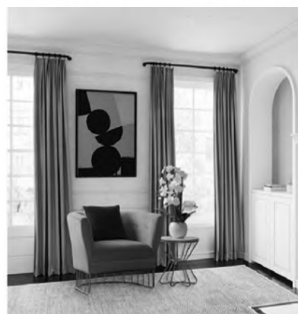
Relax and unwind in this Jetson Accent Chair with tufted backrest and metal wire legs in gold.