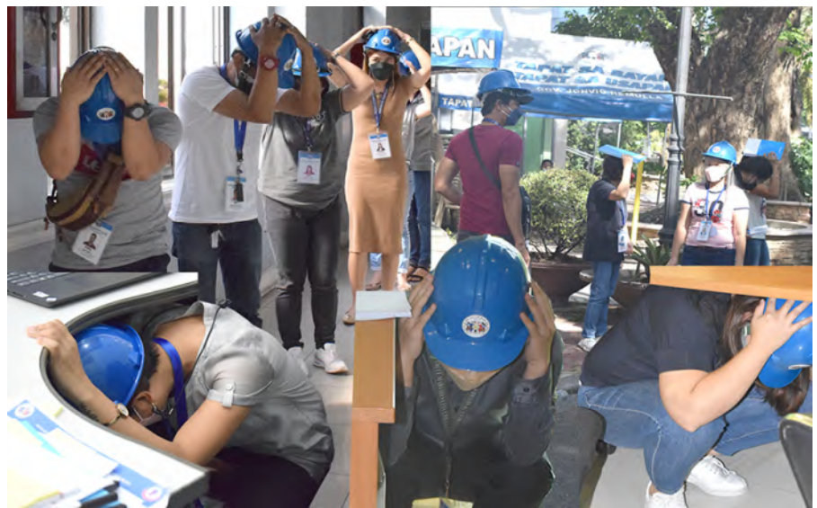
PGC employees took part in the 1st Quarter NSED: Employees of the Provincial Government of Cavite participated in the First Quarter Nationwide Simultaneous Earthquake Drill held on March 10, 2022 and coordinated by the Provincial Disaster Risk Reduction and Management Office (PDRRMO). The objective of the exercise is to reinforce the preparedness of PGC employees in case of earthquakes and minimize the risks associated with the disaster, thus, ensuring their safety. All employees on site took part in the earthquake drill and followed the necessary steps – duck, cover and hold. Full cooperation was observed as employees dropped on their knees, covered their heads or took cover under sturdy desks upon the signal of the siren and safely evacuated their offices. Proper accounting was also done as employees submitted a list of all employees who are present. Since emergencies are inevitable and earthquake is natural, NSED serves as a reminder to always stay alert, prepared and to respond accordingly. (PICAD)

votes for Robredo’s fiercest rival, the frontrunner and late dictator’s son ROBREDO • 12